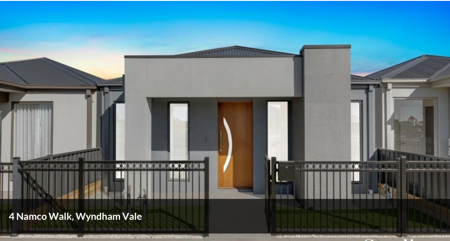
4 Namco Walk, Wyndham Vale